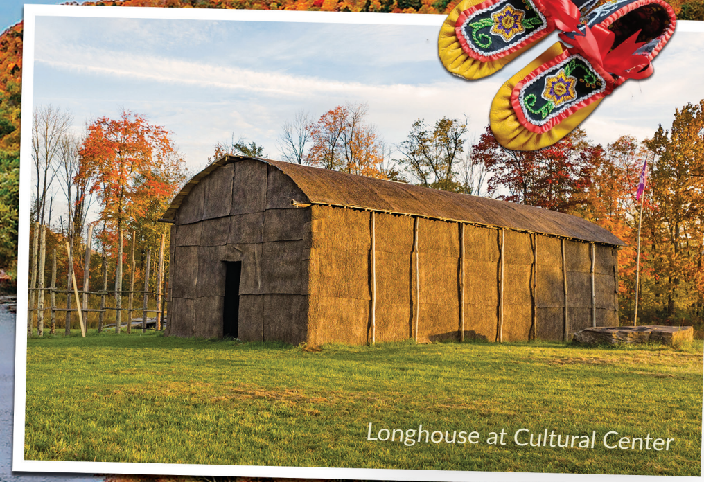
Longhouse at Cultural Center