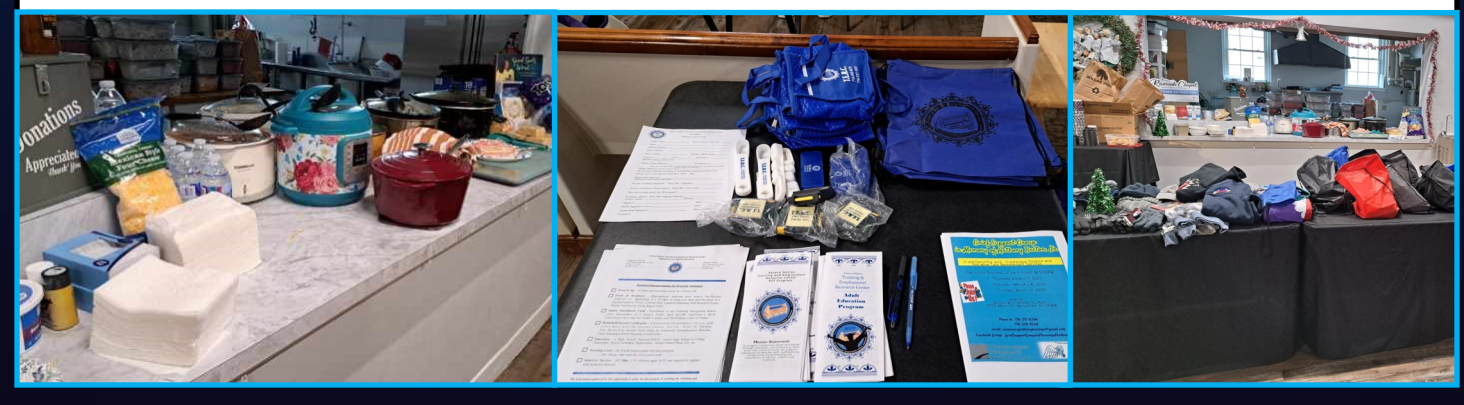
Allegany TERC Youth Coordinator